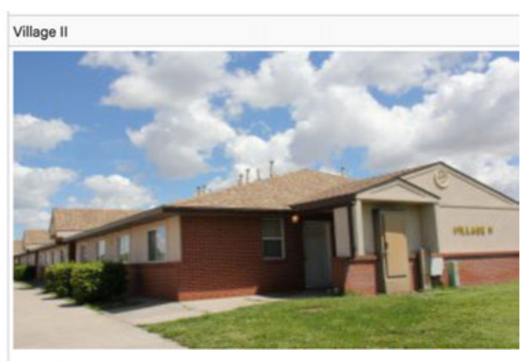
1204 E. 13th 2 bedrooms (up to 4 students) Shared kitchen, & bathroom Includes 19 meals/week

Village II. Students will be responsible for their own meals, personal items, and cleaning the rooms. Residents of Village II may purchase meals, snacks, and other refreshments in the Student Union Cafeteria.